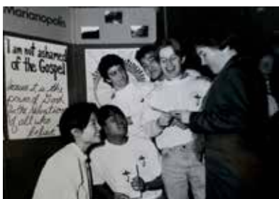
Marianopolis Catholic Action