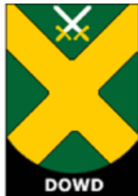
Father Dowd Foundation