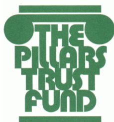
Pillars Trust Fund