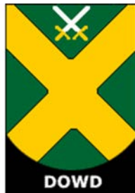
Father Dowd Foundation